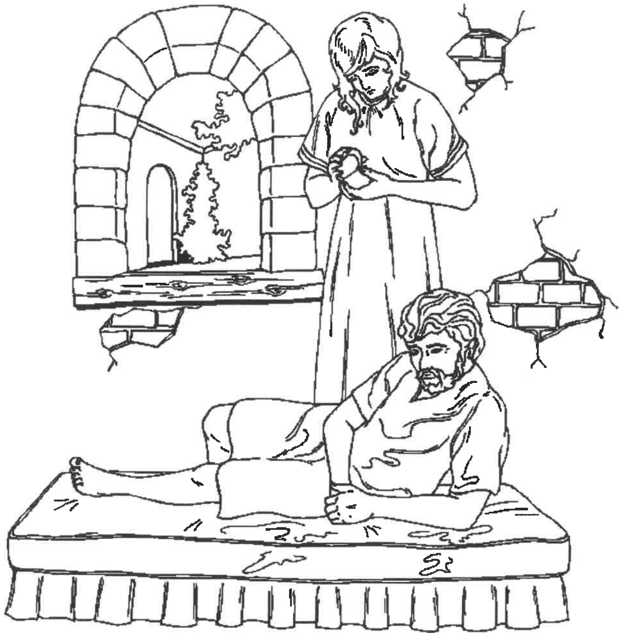
Mary shows her love for Jesus.

Mary took a very expensive bottle of perfume and poured it on Jesus' feet. She wiped them with her hair, and the sweet smell of the perfume filled the house.