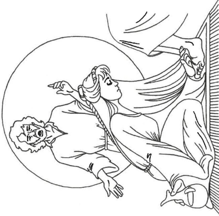
Mary Anoints Jesus' Feet John 12:1-8