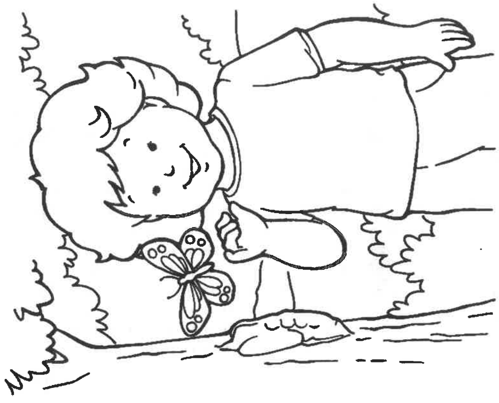
Jesus is special. He can do miracles.

From Thru-the-Bible Coloring Pages for Ages 4-8. © 1986, 1988 Standard Publishing. Used by permission. Reproducible Coloring Books may be purchased from Standard Publishing, www.standardpub.com