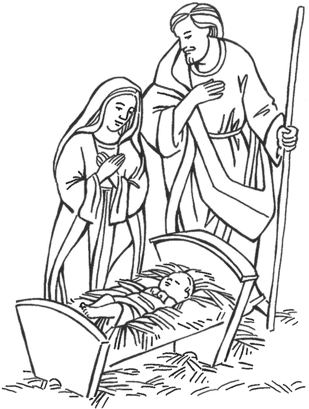
The Word became flesh and made his dwelling among us.