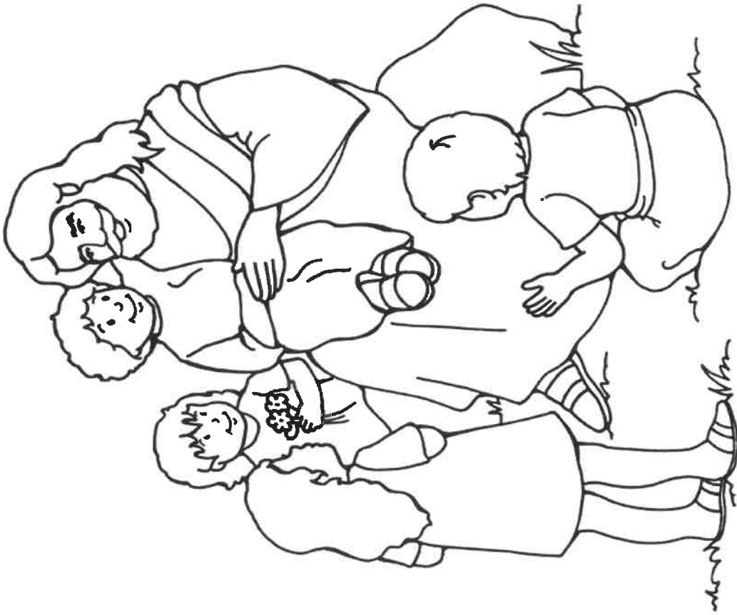
Jesus and the Children

From Thru-the-Bible Coloring Pages © 1986, 1988 Standard Publishing. Used by permission. Reproducible Coloring Books may be purchased from Standard Publishing, www.standardpub.com , 1-800-323-7543.