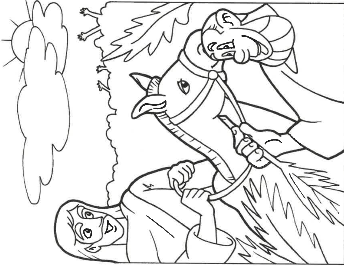
The Triumphal Entry