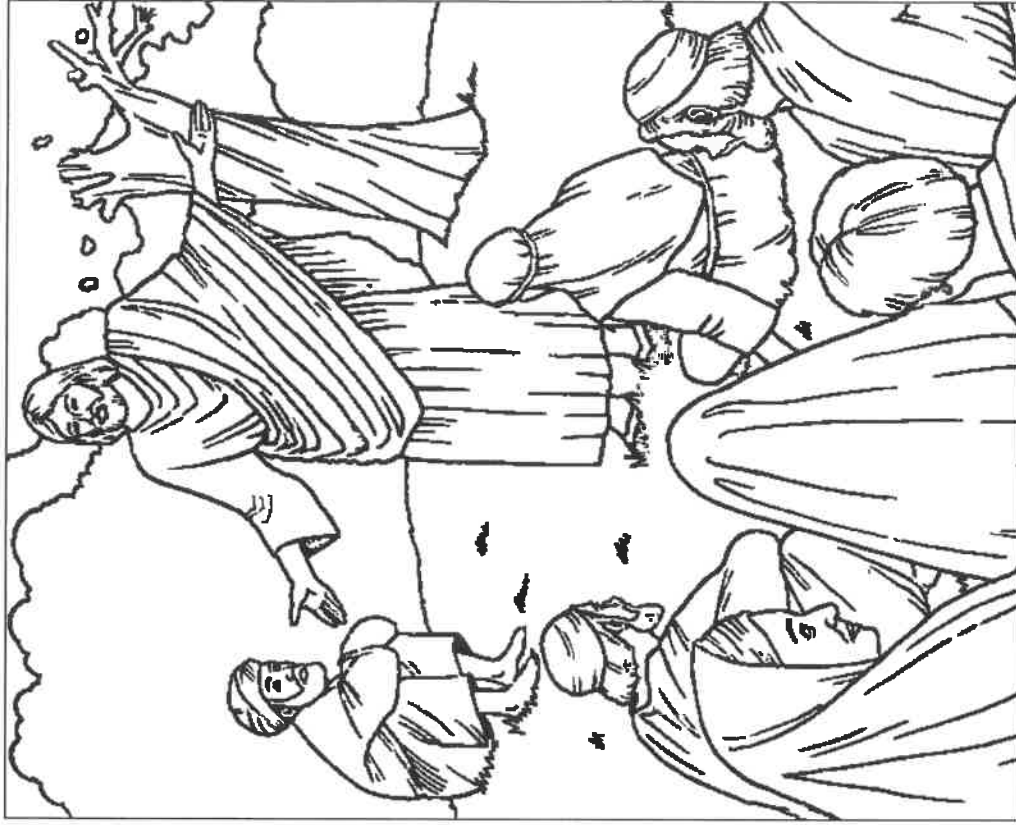
The Sermon on the Mount Matthew 5:1-12

From BibleStoryCard Learning System(tm) Coloring Book © 1996 Wesleyan Publishing House. Used by permission. Additional BibleStoryCard resources are available by calling 1-800-493-7539 or visiting online http://www.wesleyan.org/941/biblestorycards