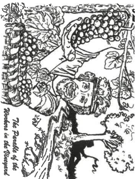
The Parable of the Workers in the Vineyard